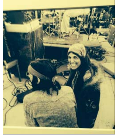
Rock and Nicki back in the day

Bill Laymon from the New Riders of the Purple Sage put together a trio that played dynamite music, each song picked for its connection with Rock and resonance for the occasion. There was also a showing of The Festival Express, the movie that documents the legendary train trip across Canada in 1970. At the time of original release, I had