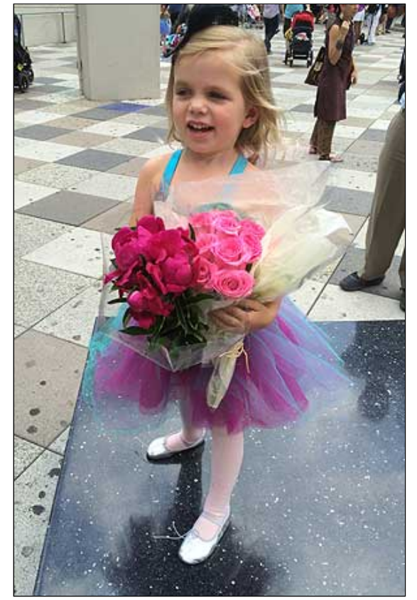
Blue after ballet recital

Blessings and love to you all, Nicki Scully