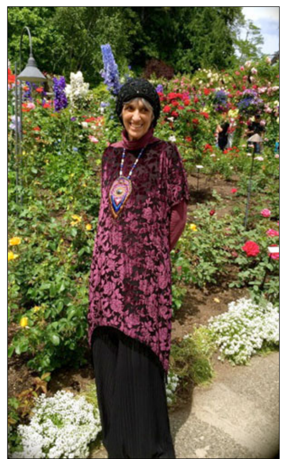
Butchart Gardens, Victoria, BC