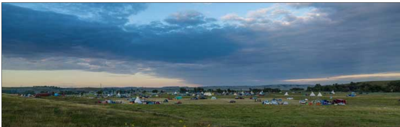
Sacred Stone Camp