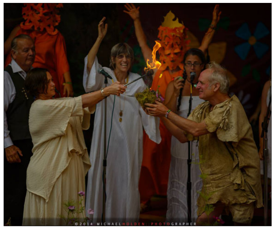
Oregon Country Fair Opening Ceremony