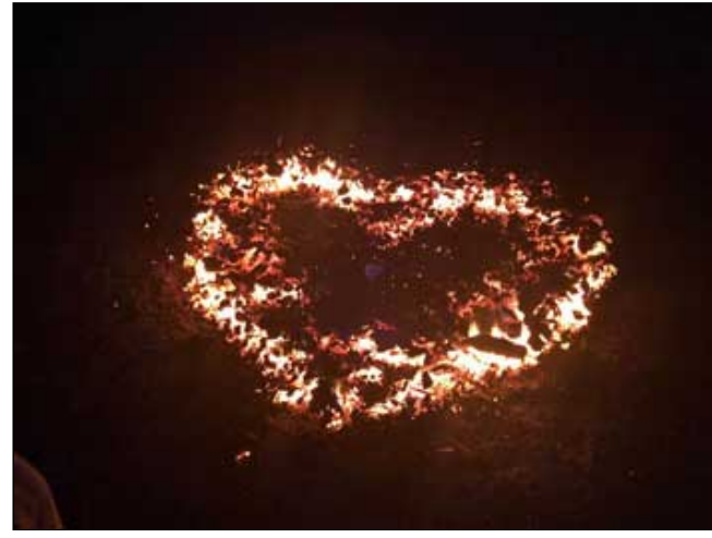
Burning the old altered space temple