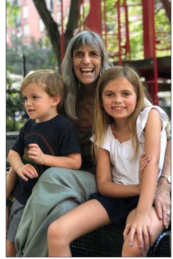
Nicki with Wiley and Blue

Happy Equinox! Whether you are in the northern or southern hemisphere, the equinox is the day when day and night are equal, and if it is fall, as it is here in the US, the nights will continue to lengthen and the days shorten. The date of the fall equinox varies from year to year, and the