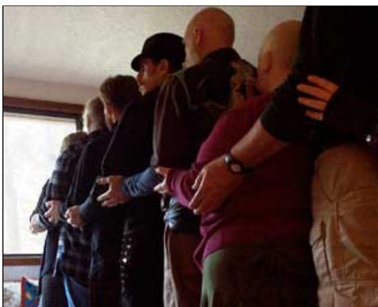
Alchemical Healing class, Portland, January 2013