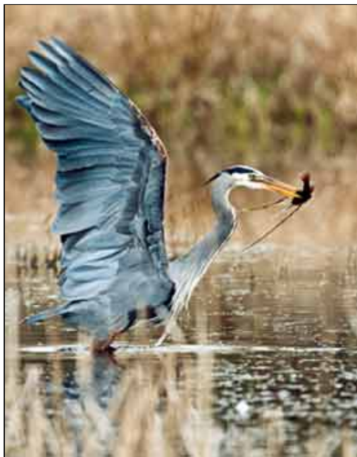
Great Blue Heron in William L. Finley National Wildlife Refuge, Oregon