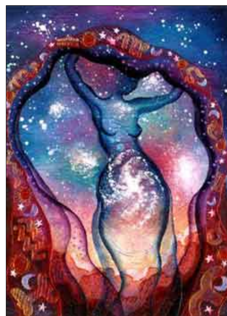
Astarte by Willow Arlenea

And, by the way, we still have room to take you to Egypt in March . Indigo and I spoke this morning and the Egyptian Mysteries work is starting to come in more clearly. It is interesting how our service work project with the women and children of Egypt ties in with the personal and planetary alchemy that the neteru, the gods of Egypt, are designing for us. They always keep us in suspense until the last minute, but they treated us to a partial overview of what we will be doing for