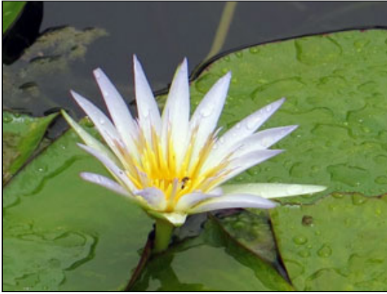
Egyptian Blue Lotus

throughout the temples on its walls and columns. It was also included in many sacred rites and initiations.