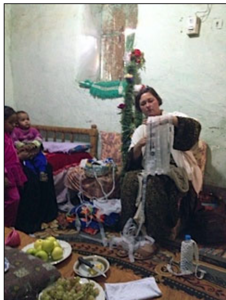
Indigo in Bahariya

The Zahra Foundation is a not-for-profit foundation I created to help Egypt deal with the huge and mounting problem of plastic waste. By educating and training women from Cairo and certain desert oases to repurpose the ubiquitous plastic bags blowing in the desert winds and through the towns and cities of Egypt, we are literally weaving change, enhancing the economy, and changing the landscape.