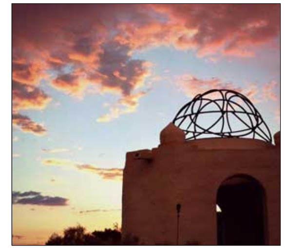
Sunset at the Temple of Goddess Spirituality in Cactus Springs

What I love most about private consultations, whether they are Anubis Oracle readings,