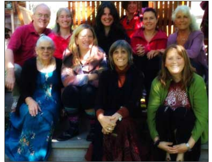
This Year's Alchemical and Planetary Healing Intensive Retreat Attendees