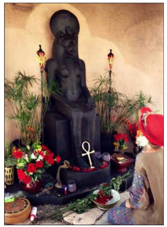
The New Sekhmet at the Goddess Temple

Alchemical Healings, Shamanic Consultations, Egyptian Soul Retrievals, or simply one-on-one initiations as the subjects arise, is that it seems as though no matter what the subject, disease, or question, the work is always reciprocal— whatever is needed for the person(s) is just what I need to be doing and learning at that particular moment. It's like holding up a mirror for myself as well as for my client. So private and small group sessions are definitely desirable. I may not always be available, but I can almost always work something out, and with Skype, the video/phone call is free and it is as good as being in the same room. you can even see your cards if you are having a reading.