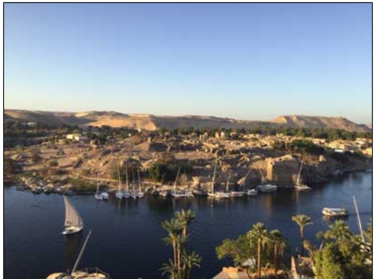
View from Elephantine Island Temple

Egypt—her name invokes exotic images of monuments such as the Great Pyramid, the Sphinx, and magnificent temples the likes of which are not seen anywhere else in the world. While most everyone is familiar with the Sphinx and the Pyramids, the remaining great temples and monuments, mostly in the South of the country, were built by adepts who were so intent on making sure that what they believed to be true would remain to enlighten future millennia that they not only built to last. They expressed their wisdom in both hieroglyphs and