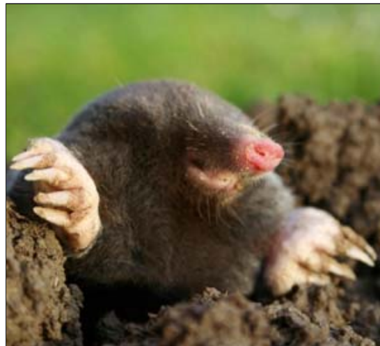
Mole: The Oregon "Groundhog"

The work we do in Alchemical Healing that pertains to weather requires the High Self of each participant to be included— that a wisdom greater than that of our day-to-day musings awakens in us and sees a bigger picture. With the help and guidance from our High Self we can ask for weather that is positive and offers a greater good that benefits all forms of life, near and far. We've both had the experience of going into ceremony with a clear wish, only to watch our original desire become small, even petty in the face of a greater need that only occurred to us once the High Self became engaged.