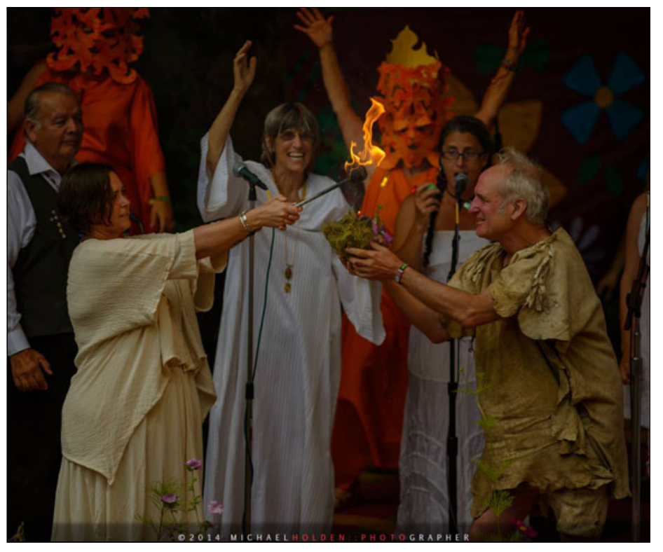
Oregon Country Fair Opening Ceremony