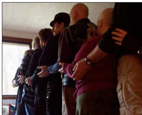
Alchemical Healing class, Portland, January 2013