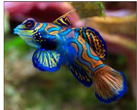
The Mandarinfish is native to the Pacific.

I so want to eat Pacific seafood, but every time I go to buy it I wish I were carrying a hand held Geiger counter. As a result, I don't eat fish anymore except when the urge overwhelms me. Even then I exercise discernment; I avoid fish that cruise the waters of Japan. Can you believe it has come to this? Am I paranoid or are we being bombarded with unnecessary news static to cover a real problem, misinformation, straight up lies, or simply not being informed as to the true health of our blessed Pacific Ocean. Water pollution is systemic throughout the planet, and its distribution is being rearranged in unfamiliar and scary ways by climate change, yet the huge elephant/octopus in the room for me is Fukushima.