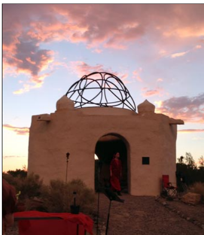
Sekhmet Temple in the Desert, Las Vegas