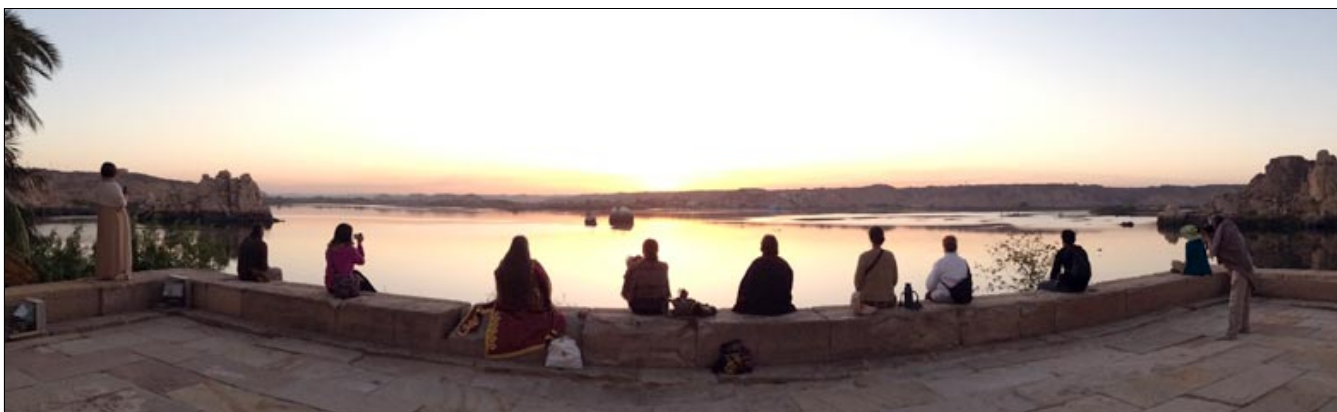
Sunrise at Philae, photo by Jake Cohl