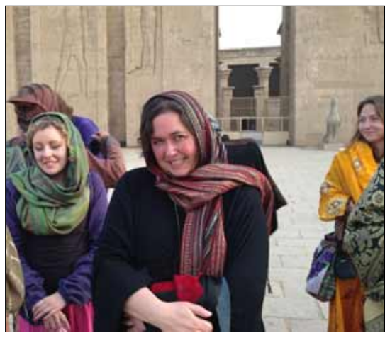
Indigo in Egypt

than most. The only difference Indigo felt was heightened security, and the knowledge that they were either tracked or accompanied and watched over by tourist police throughout their