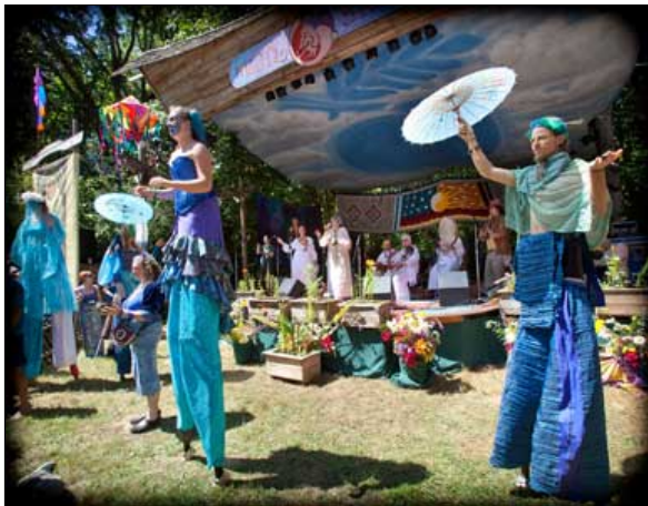
OCF Opening Ceremony, 2012