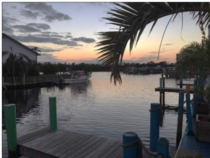
Bonita Springs, Florida