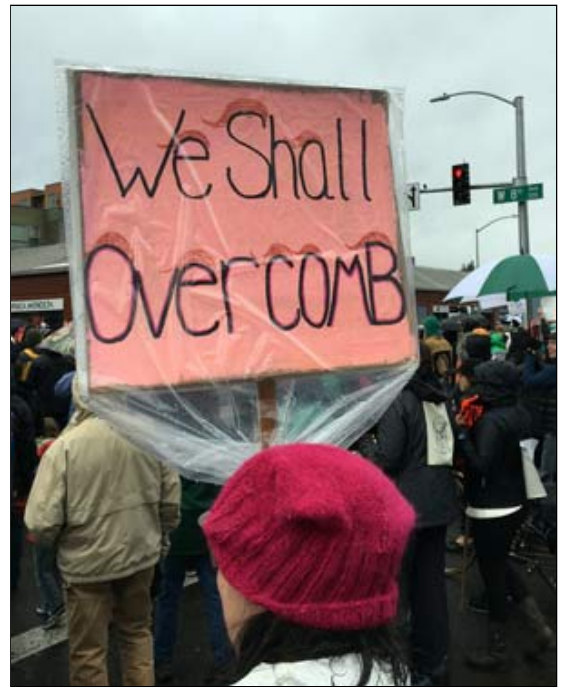
We Shall Overcomb

Ultimately, it seems to come down to the question of how we survive the changes that are currently challenging us, regardless of the stated objectives of our new administration. Obviously, what's happening on the planet is not new. Although technology offers us access that has never before been available since history has been recorded, history itself seems to have lost its potential to educate. Our new technological toys allow everyone the ability to receive our messages when we speak from the heart, but most missives get overlooked. I would not be surprised if my own list sometimes feels overwhelmed. Yet it's up to me to keep my messages true and compelling.