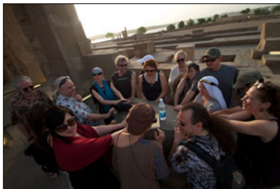
Coherence at Kom Ombo, Egypt

I am hopeful that we will get through our current crisis by adapting, modifying our expectations (I hope not by reducing them), and continuing to seek to become our most enlightened selves. We've been here before, and hopefully we improve and elevate with each new round. I think many of us have been sleeping—dreaming away the problems of the world. Now, as if a bucket of cold water has been thrown upon us, we feel the need like never before to get involved. Yet even epiphanies can hit us like that bucket of water. That, or, we can circle around and around, spending time slowly closing in on enlightenment. That, the latter of the two, has been the historical and very individual approach. Today feels different. Today is the day of mass epiphanies accompanied with the sound of many individuals shaking off the cold water while arising from their comfortable chairs in order to act upon those revelations that have just swept the nation, although they came from the heart of each of us, spontaneously.