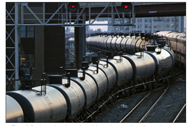
Fossil fuel carrier. Imagine this train passing through your town several times a day.

Some of you are in a position, or at least capable of, going after the industrial complex behind the lack of regulatory safety issues, while others can educate yourselves, broaden your scope of knowledge, and go after individual problems at the grass-roots level. For