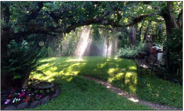
A moment in Fairyland, home sweet home

As I write this, the last of Shamanic Journeys, Ltd. participants are gathered in